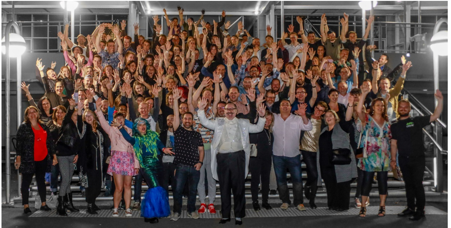
JOY Members @ CHER Concert