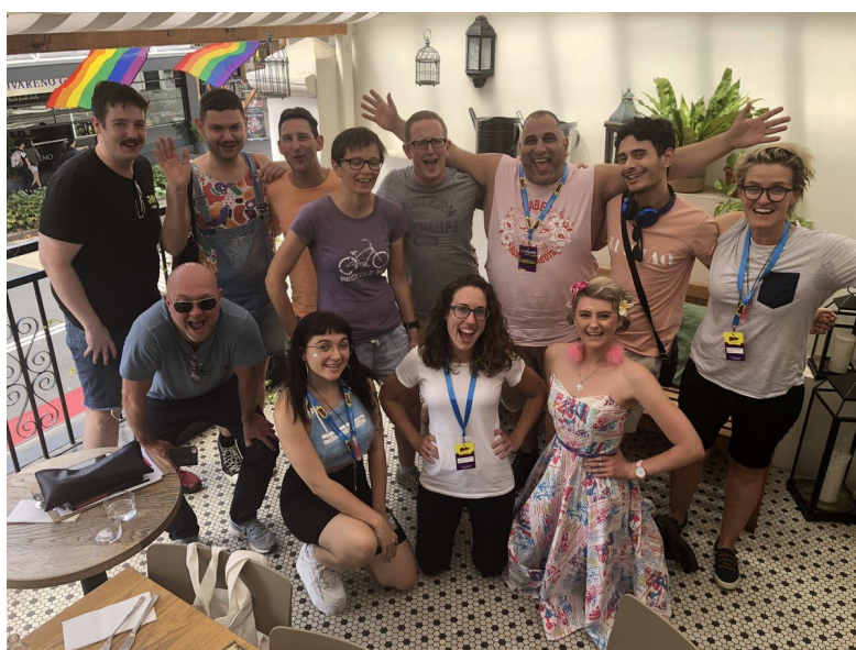
JOY@ Mardi Gras