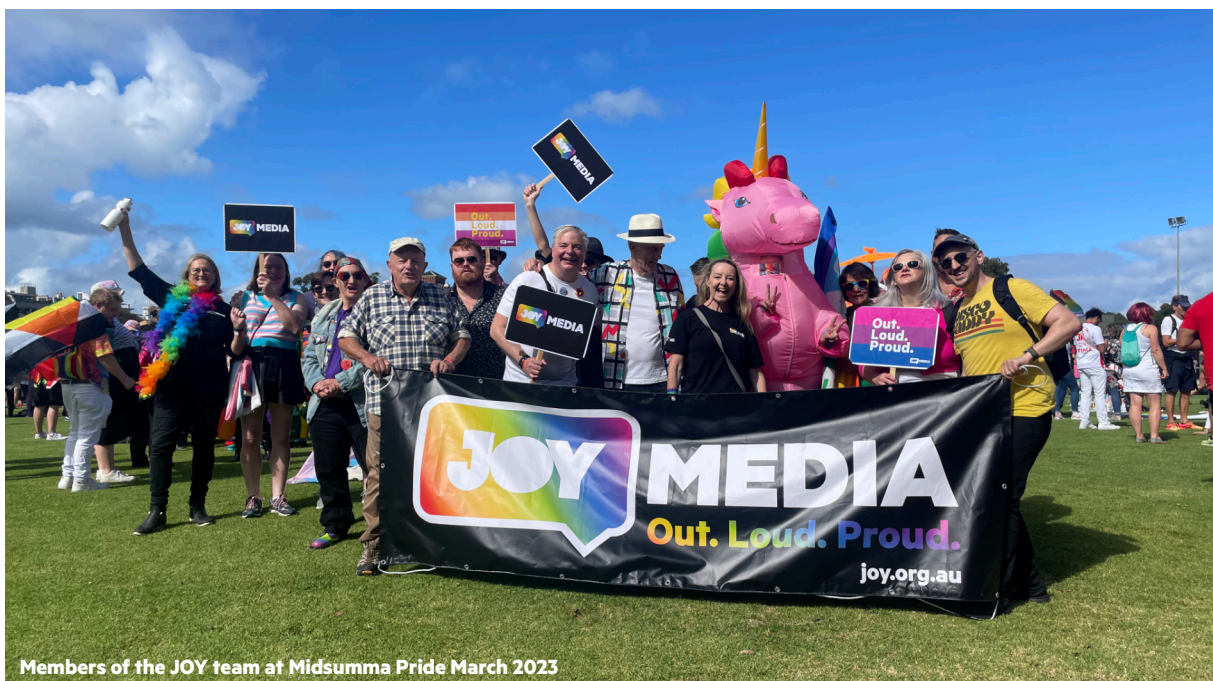
Members of the JOY team at Midsumma Pride March 2023